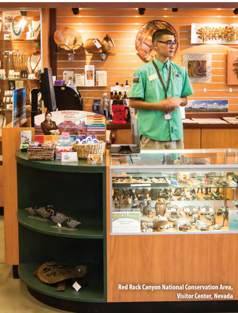
Red Rock Canyon National Conservation Area, Visitor Center, Nevada